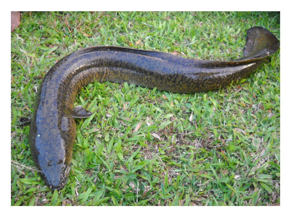
Fig. 2. The Mottled Eel Anguilla marmorata from Bago River