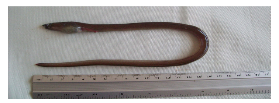
Fig. 4. The snake eel Neenchelys sp. from the estuary of Bago.