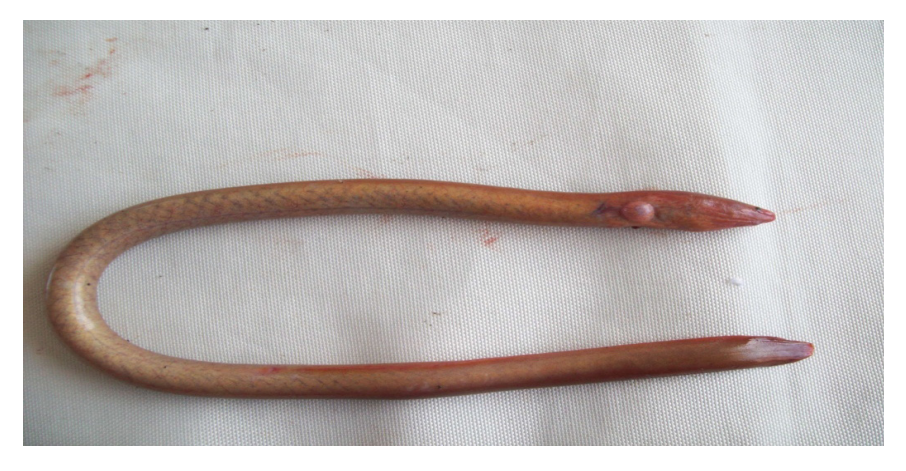
Fig. 3. Moringua raitaborua from Bago River Estuary, Negros Occidental.