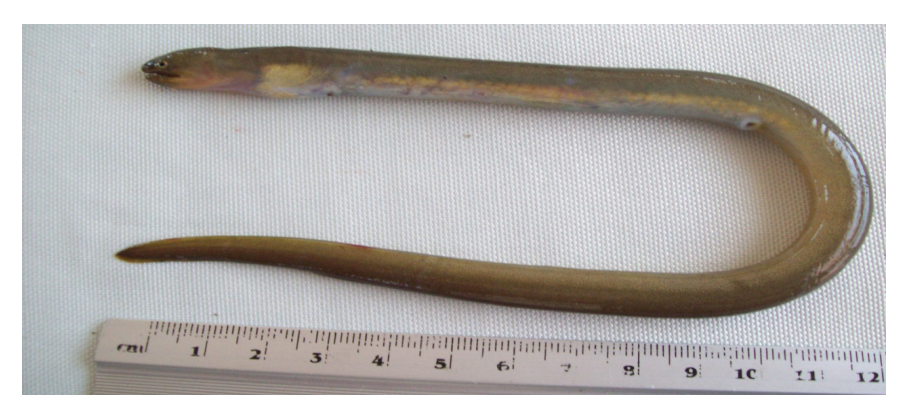
Fig. 5. Muraenichthys thompsoni from Bago River estuary.