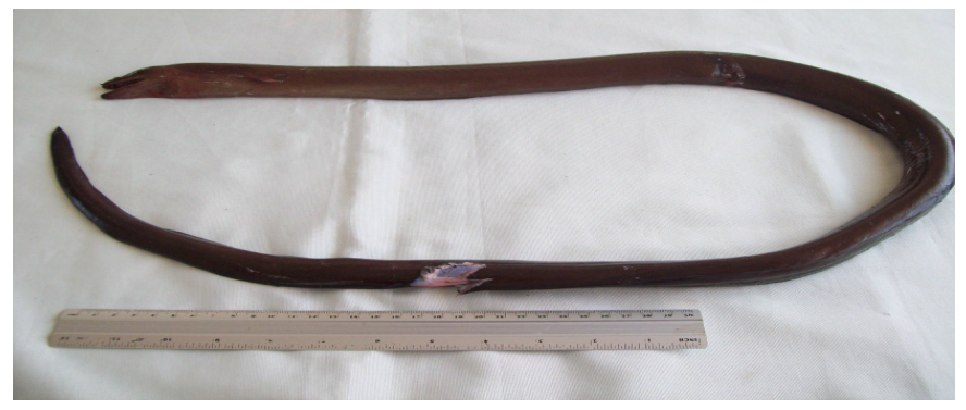
Fig. 6. A moray eel (Strophidon sathete) from Bago River.